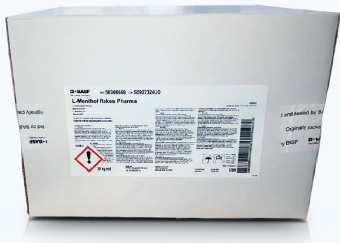
L-Menthol flakes Pharma (20 kg card box with liner)

L-Menthol Pharma is also available as melt (PRD number 30573723) in 180 kg steel drums (article number 50309181).