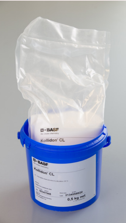
Product samples are provided in PeroXeal® packaging.